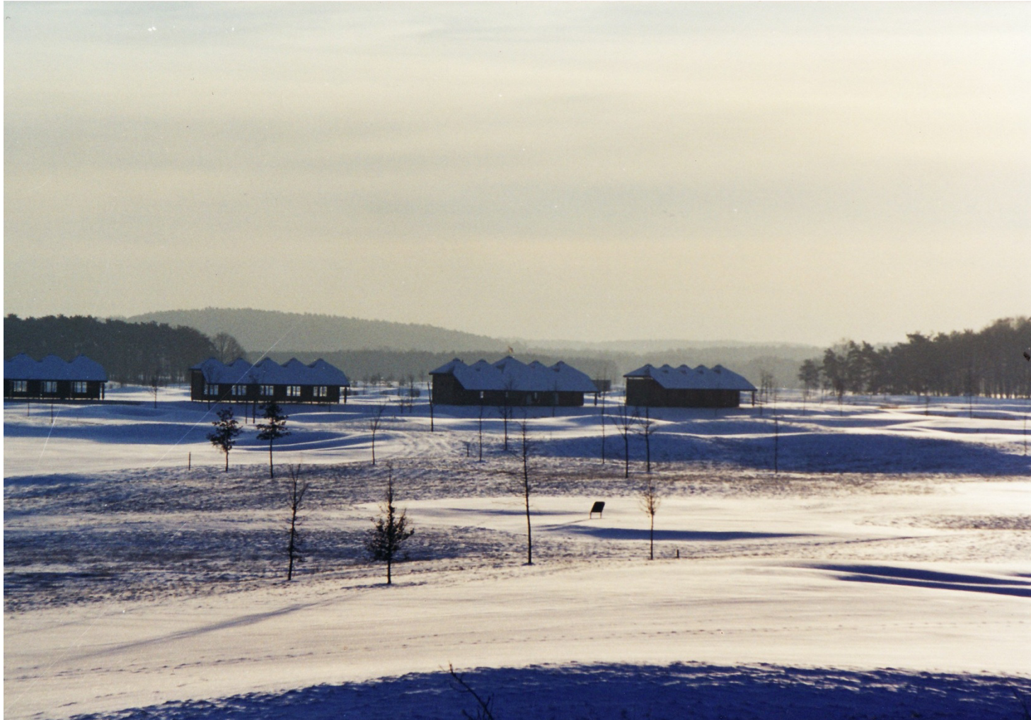
Golf u. Country Club Seddiner See – April 1996